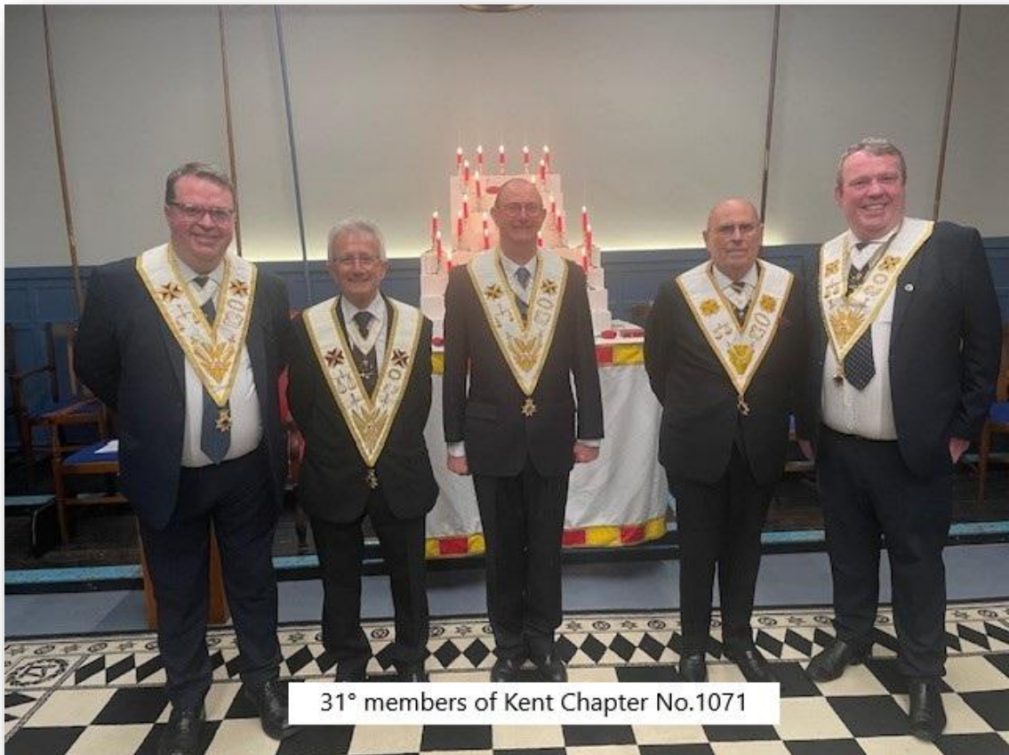
31° members of Kent Chapter No.1071