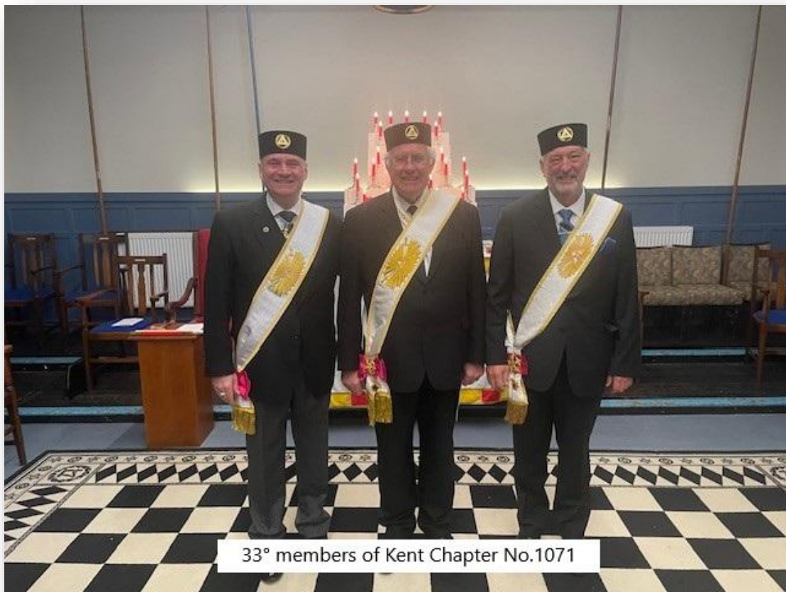
33° members of Kent Chapter No.1071