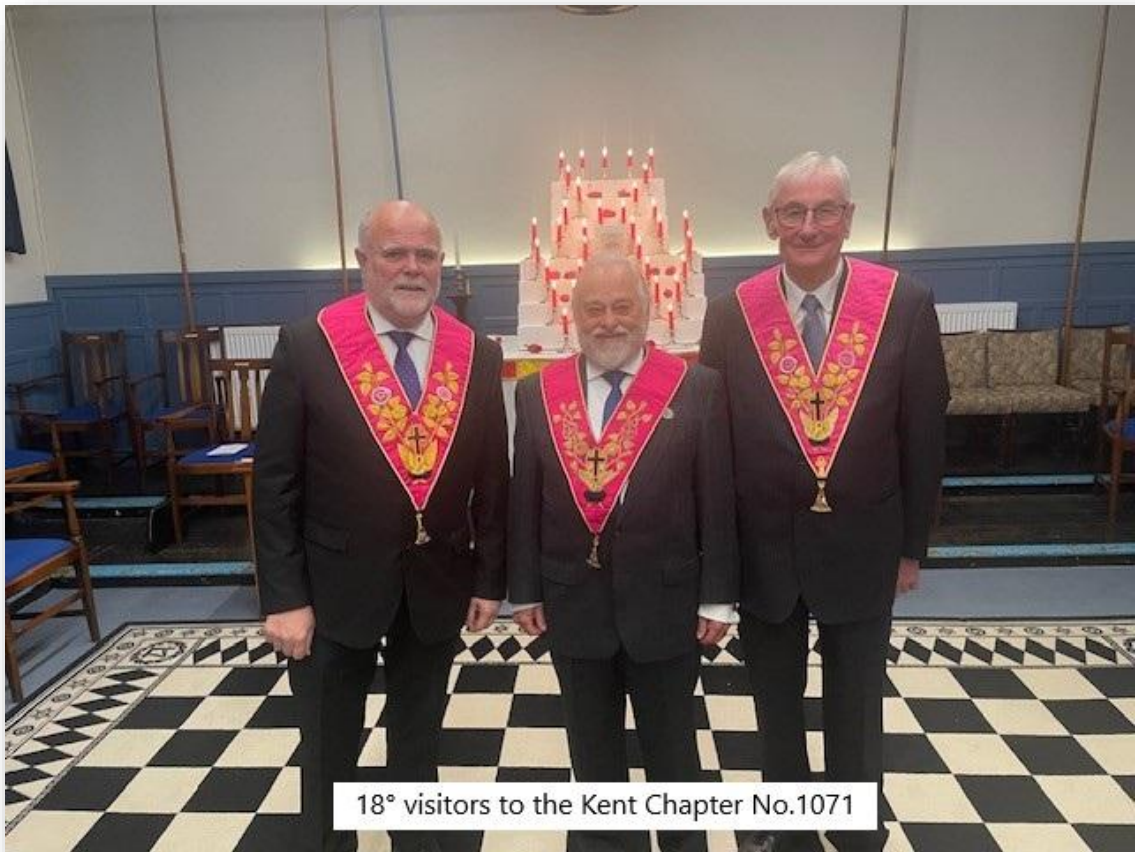
18° visitors to the Kent Chapter No.1071