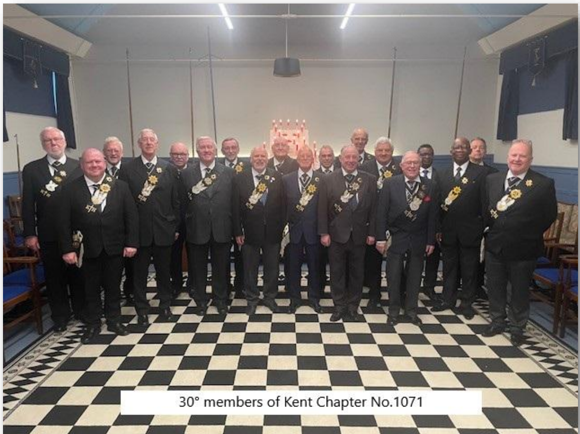
30° members of Kent Chapter No.1071