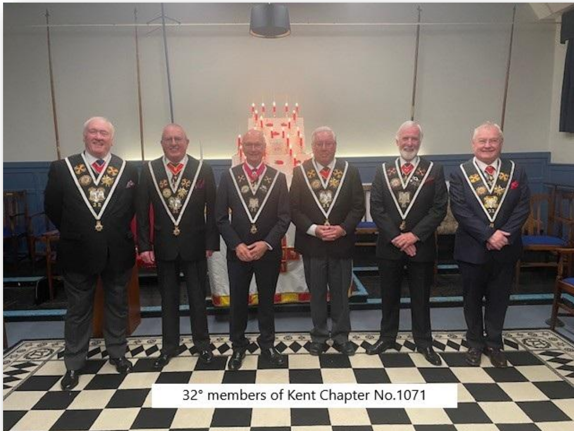
32° members of Kent Chapter No.1071