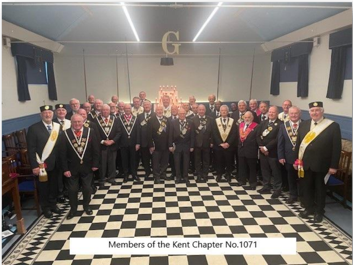
Members of the Kent Chapter No.1071